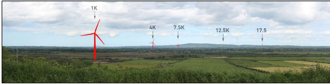
Figure 1-1 The effect of distance on visibility of wind turbines (Illustrative Purposes Only)